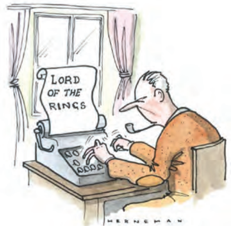
Mordor, he wrote